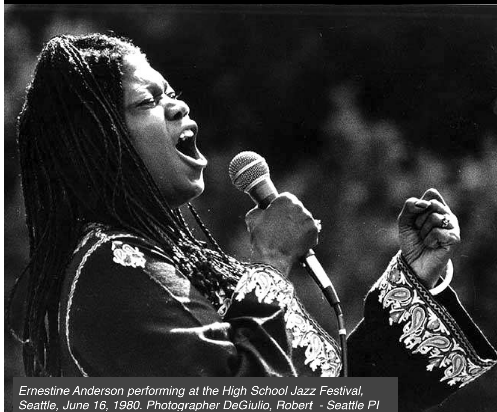
Ernestine Anderson performing at the High School Jazz Festival, Seattle, June 16, 1980.